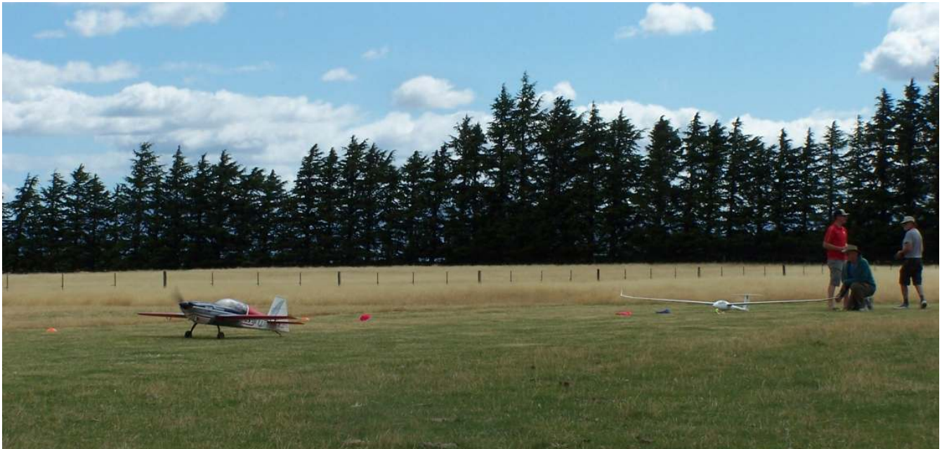
Models lining up for take-off.