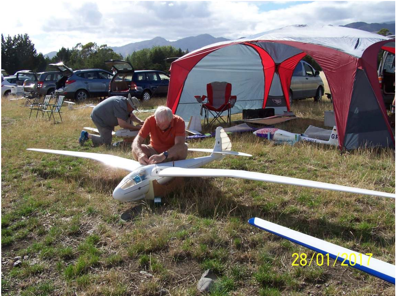
Models being assembled.