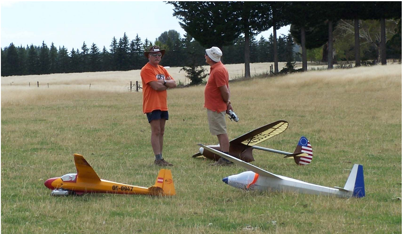
Off for another Flight

More Gliders waiting their turn. There were a variety of model from Vintage wood and fabric models to modern Fibreglass, and sizes from 2 metres to over 5 metres. Well done to all those involved.